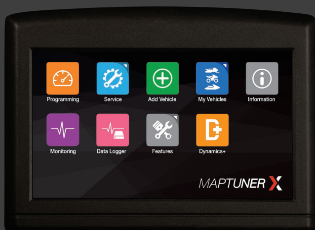
HANDHELD PROGRAMMING UNIT